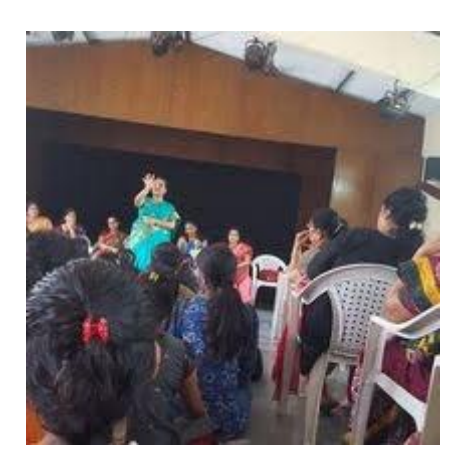
22/11/2015 - Career Orientation Programme - by alumni -70 Students